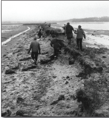
A school party just manages to navigate a muddy way around Newtown Marsh embankment at low tide, 1965.