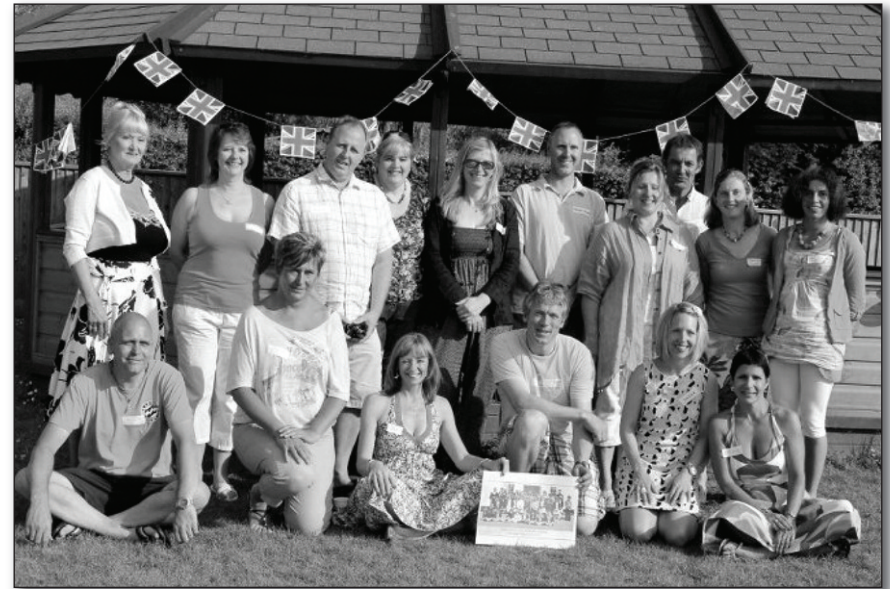
Many of the Shalfleet School pupils of 1977 gathered at the school again in 2012 to mark the Diamond Jubilee.