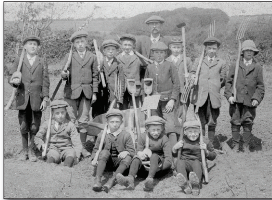
Locks Green School's gardening class in 1912.