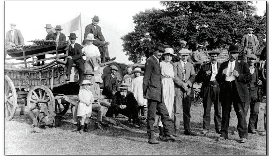
An early invasion of day-trippers visit Stone Steps Tea Gardens, c.1920.