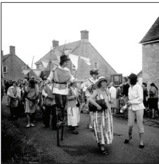
Example of a double-page spread.